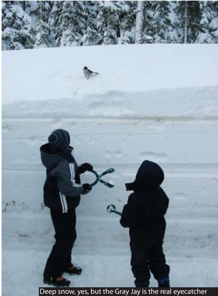
Deep snow, yes, but the Gray Jay is the real eyecatcher