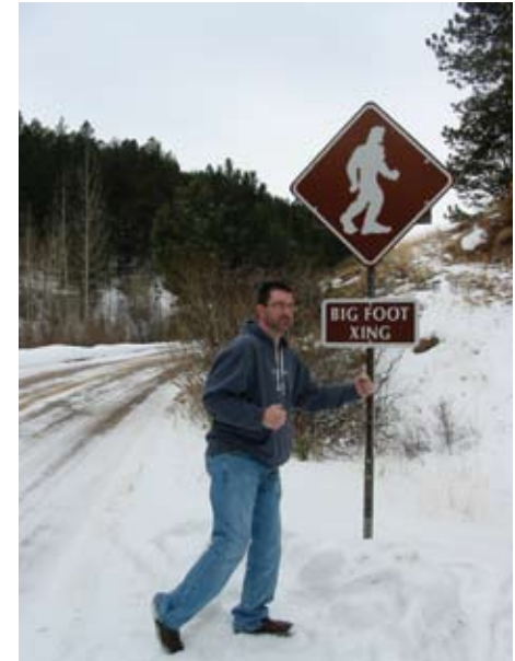
Unusual sighting of Sasquatch