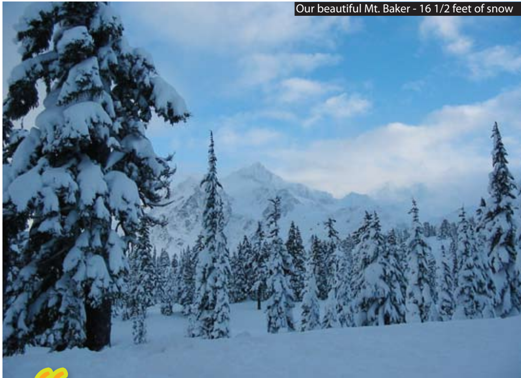
Our beautiful Mt. Baker - 16 1/2 feet of snow